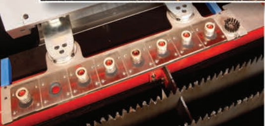
An 8-station changer automatically changes, cleans and calibrates the nozzle based on material processing requirements